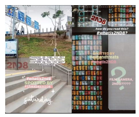
Pictures 1. An example of the buzz marketing done by the influencers for Secondate

not its beauty products. However, what interest-ing was Secondate did buzz marketing with influencers on Instagram social media, not buzzers. These influencers within a certain period of time together uploaded photos of places in Indonesia and abroad that appear with the words 2ND8 (read: Secondate). The photos were made as if the words 2ND8 really existed and were real. In addition, these influencers also uploaded videos or photos of their mirror selfies using a mobile phone case or pink case with the words 2ND8 on the back.