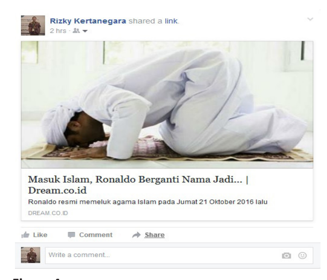
Figure 4 The news feeds about Ronaldo

site. However, the use of this technique manipulates the curiosity of the reader. Yet, Indonesia is test with ethnic, religious, racial and inter groups (SARA) issue so that it can threaten the nation value of existing diversity. In this case, there is the issue of Islamic glorification that can be a threat to national resilience toward socio-cultural aspects.