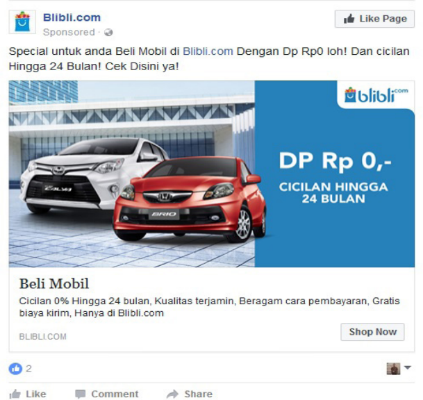
Figure 3 Online ad feed of Blibli.com in Facebook

There are two types of clickbait headline. First, clickbait headline used by news content producers on social media platform as shown in figure 2. Second, clickbait headline used by advertisers on social media as shown in figure 3. The goal from these types of clickbait headline is the same; clickbait headline could provoke the readers to click on an online news site or an advertiser's company website.