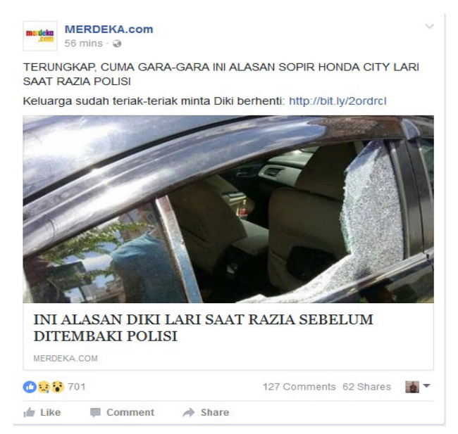
Figure 2 Online news feed of Merdeka.com in Facebook

There are two types of clickbait headline. First, clickbait headline used by news content producers on social media platform as shown in figure 2. Second, clickbait headline used by advertisers on social media as shown in figure 3. The goal from these types of clickbait headline is the same; clickbait headline could provoke the readers to click on an online news site or an advertiser's company website.