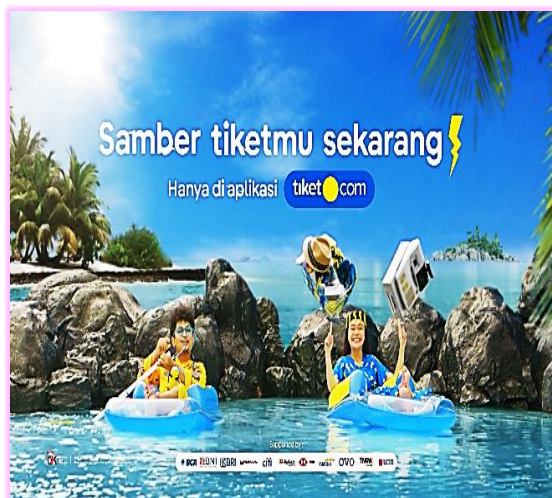
Figure 5. OTW Official Advertisement on Youtube

To introduce each event to the public, Tiket.com makes short advertisements as one of the promotional media to attract customers' purchasing power and enthusiasm. Tiket.com, during OTW activities, made official 15-second advertisements which were then distributed via Youtube, TikTok, Instagram, Facebook, IQIYI, and various other social media. According to Executive Domestic Flight Tiket.com (2021), marketing activities must use attractive and persuasive language. Sales schemes also need to be considered to make it easier for customers to make purchasing decisions.