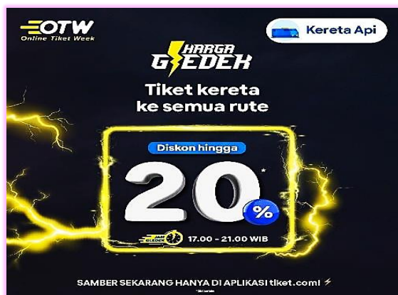
Figure 3. Online Tiket Week on Facebook

Similar to Facebook, Tiket.com also promotes OTW activities by re-uploading photos or videos regarding information about discounts that will be obtained.