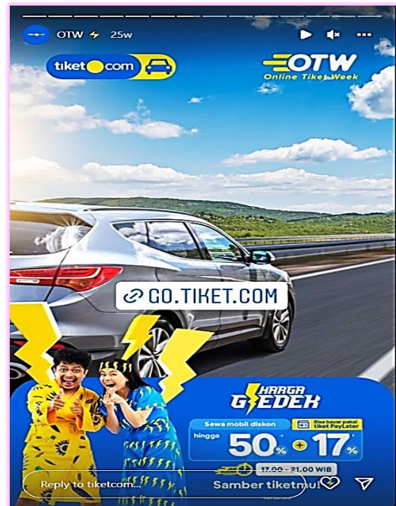
Figure 2. Online Tiket Week on Instagram Story