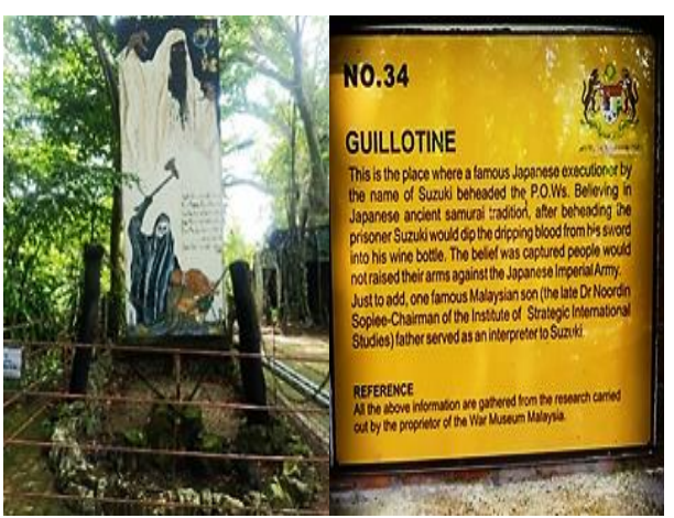
Figure 2. The display of the Japanese guillotine at Penang War Museum, Penang

(23-Malay), Aidil (28-Malay), ZA (47-Malay), TS (41-Malay), CST (57-Chinese), YBH (39-Chinese) and NK (53-Indian) emphasized that what is displayed in Penang War Museum gives the clear evidence of the sorrow brought by the Japanese in the past. Penang War Museum is the strongest symbol of World War 2's horror in Malaysia placing the Japanese at the most antagonistic site. El (25), the Chinese girl working at Penang War Museum explained that she never witnesses the Japanese visit the museum, except for academic or research purposes. Meaning, for the contemporary Japanese inheriting the history of the colonization period, it also brings a sort of traumatic sense.