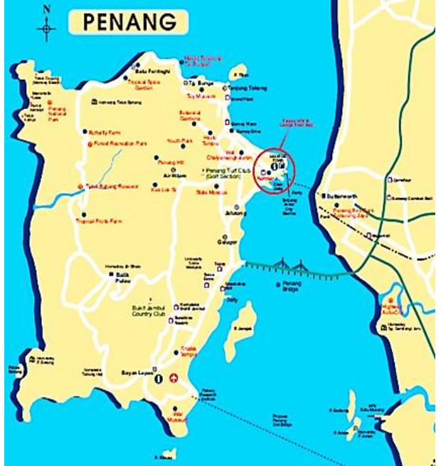
Figure 3. Penang Tourism Map

In Penang, the rise of the Japanese investment has been marked by the arrival of Malayawata Steel, Penang in 1961. It was a joint venture between the Malaysian government and Yawata Steel from Japan. It directly has increased the number of Japanese livings in Penang, both as expatriates working in several of Japan's companies or those who are contemporary living in Penang and other Malaysian states as a tourist. The official data from the Japan Embassy in Malaysia shows that around 1400 Japan's enterprises operated in Malaysia in 2019. Moreover, 27,215 Japanese are claimed to reside in the country, including 3056 lived in Penang. Thus, the Japanese visitors in Penang can be divided into two different types; the Japanese tourists directly coming from Japan and the Japanese residing in Malaysia visiting Penang both for official trips or holiday trips.