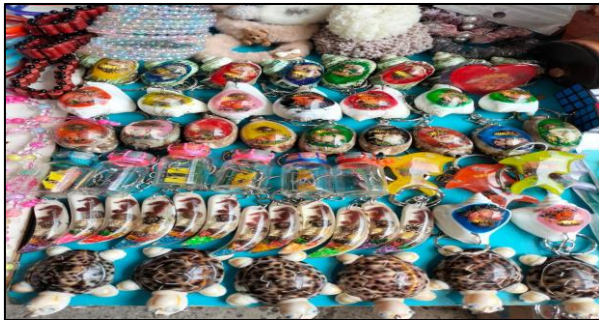
Figure 1. Beads

The beads traded around Kenjeran Beach Surabaya are made from shells in Pasir Putih, which are processed independently or by collectors. This is the main attraction at Kenjeran Beach because only on this beach can beads be made from shells. The shells taken from Pasir Putih are cleaned and processed to be used as accessories.